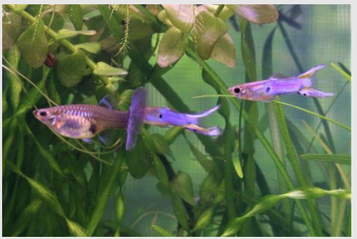
Fig 4. Swordtail X Blue Grass Outcross

Lyretail Males, newly purchased from a pet store, are shown courting a Blue Grass female. She produced a brood 21 days later. About half of her ~50 offspring were sired by these novel (to her) males. (The two males carry the Japan Blue gene for blue body color.)