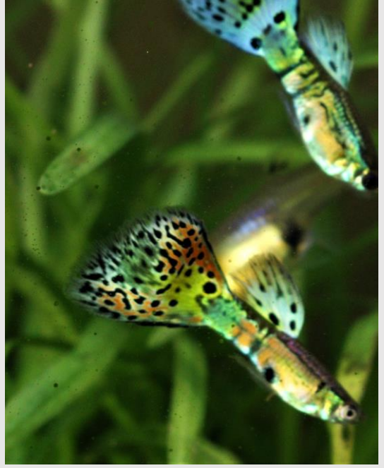
Male Progeny (F1s) showing expression of 'buried' color genes from their sire.