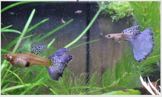
Blue Grass female shown here with a male of the same strain