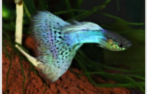
Beautiful Male (F1) from the outcross inherited the enhanced blue body color from his sire and the elaborate finnage from his dam.

Lyretail Males, newly purchased from a pet store, are shown courting a Blue Grass female. She produced a brood 21 days later. About half of her ~50 offspring were sired by these novel (to her) males. (The two males carry the Japan Blue gene for blue body color.)