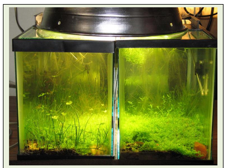
Fig 7. DSM Tanks after Submergence

The shrimp bowls were unheated. I was concerned that the plants and my RCS might do poorly during the winter. Night-time room temperatures were between 60 and 65°F, and