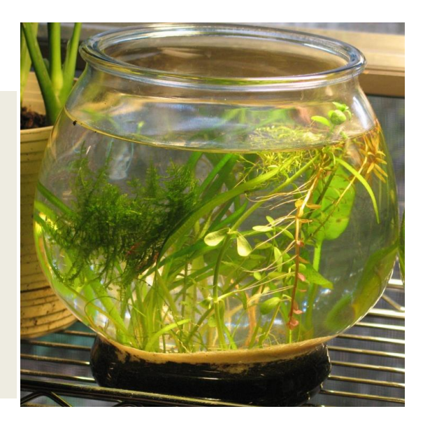
Fig 4. Established Bowls

I used plants (surplus from other tanks) that I knew would do well. Rosette and grass-like plants included Sagittaria subulata, S. graminae, Echinodorus tenellus, and E. radicans (dwarf). For stem plants, I used Bacopa monnieri and Rotala rotundifolia. I later threw in some Ludwigia arcuata, Java moss ( Vesicularia dubyana ) and Riccia fluitans. For these first 'beginner bowls', I nixed Cryptocoryne species, which can melt down during adjustment to a new environment. I did not add 'furniture' (e.g., driftwood) that would smother the soil layer, decrease the planted area, and possibly leach nutrients into the water.