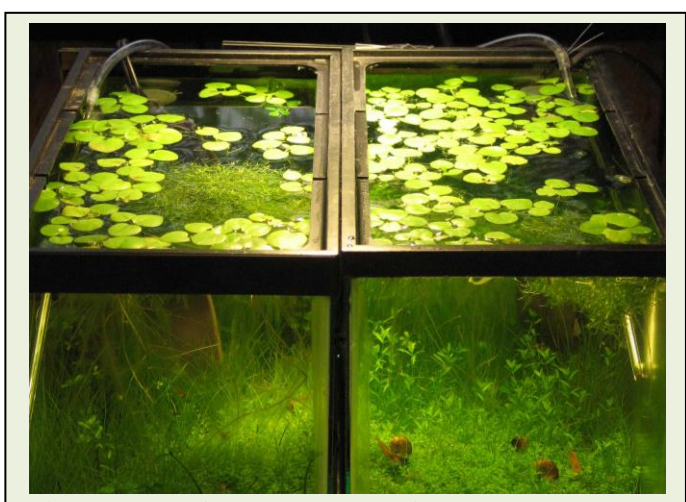
Fig 8. Frogbit to the Rescue!

Three weeks after submergence, carpet plants are growing very well. They have made such a thick mat, I can pour water into the tank without disturbing the soil layer. Tank on the right has RCS, while the tank on the left contains native Grass Shrimp.