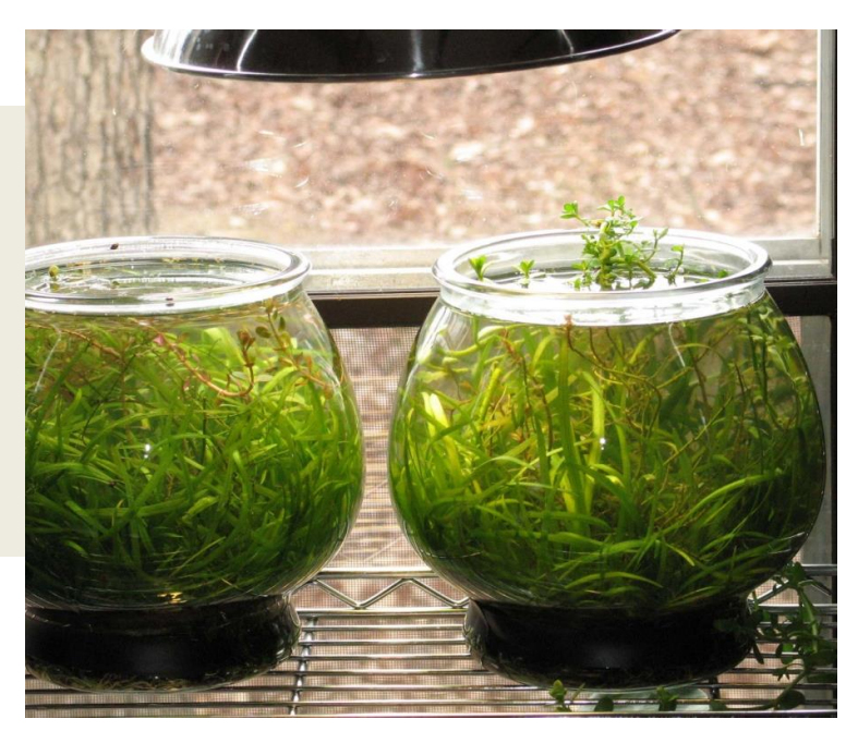
Photo shows the two bowls at 7 months (Jan 2010). Plant growth was rapid from the beginning so that the bowls positively sailed through the startup period. Bacopa monnieri is blooming and growing emergent outside one bowl. I've had to do very little maintenance except minor plant pruning and water top-offs. The bowl on the right has a little mat alga that I pull out with tweezers.