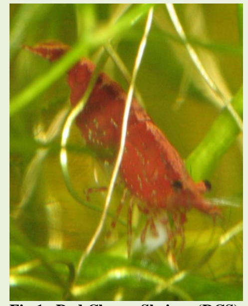
Fig 1. Red Cherry Shrimp (RCS) or Neocaridina davidi

Small shrimp tanks are a great way to start out with aquarium plants. Beginners learn how to work with soil.