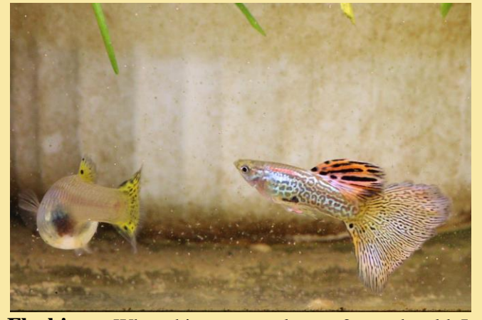
Flashing When this pretty male was 2 months old, I noted that he was "flashing." I kept an eye on him, concerned that he might have flukes. But nothing developed on him. The breeding pair (depicted here at 3 months of age) represent a promising cross between a fancy Blue-Grass male and a yellow pet store female.

Genetically susceptible fish create problems. One of my "fancy-bred" guppy strains and its progeny seemed to be particularly vulnerable to