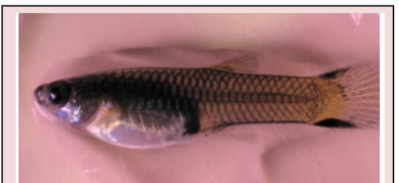
Fish Autopsy I euthanized this juvenile female guppy (2.5 cm long and about 6 weeks old), quickly and without pain, by putting her into about 1 cup of tank water in a glass jar with 2 drops of clove oil. It was essential that I mix the oil with the water beforehand; otherwise, the oil just floats on the water surface and doesn't affect the fish.

The only symptom that I initially observed was "flashing," that is, a few fish sometimes scraped against objects in the tank. On the skin of fish that had become noticeably sick, I could discern faint whitish abnormalities; their skin wasn't clean and shiny. This suggested that the problem could be an external pathogen on the fish rather than an internal problem. The fact that salt had worked so well supported my growing suspicion that the pathogen might be an external parasite.