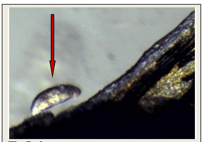
The Pathogen Revealed Photo shows a skin fluke on my guppy's skin next to one of her fins. Length of fluke is about 0.3 mm. Most likely, it is either Gyrodactylus turnbulli or G. bullatarudis , the two GYRO species commonly associated with guppies.

Determining a salt concentration that kills