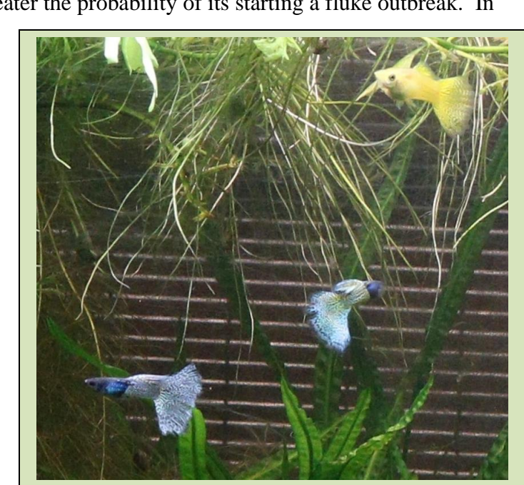
Disease Resistance Ten days after I moved these 3 males from breeding tanks into this 50 gal holding tank with other guppies, a major fluke outbreak occurred. The two purebred beauties (Metalheads at the bottom of photo) died. Other guppies like the yellow pet store male (top of photo) did much better.

Inevitably, broodstocks from Southeast Asian ponds have developed genes for parasite resistance in order to survive. Mass production of inexpensive fish in ponds does not allow for