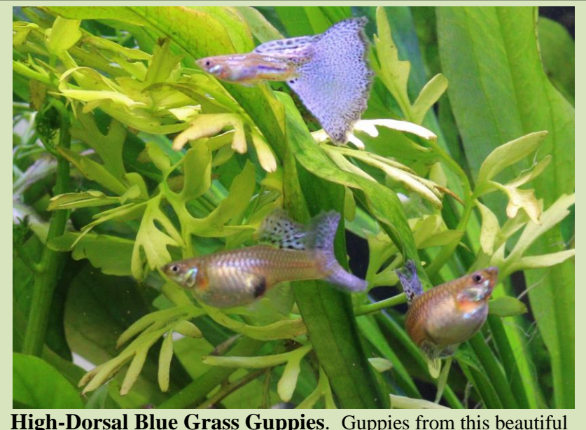
High-Dorsal Blue Grass Guppies . Guppies from this beautiful strain that I shipped in from California were ones that I was unwilling to lose. When they got sick, I took action.

Flukes have been a disease problem for guppies for a long time. Indeed, wild guppies carry them in native habitats in Trinidad. In 1964, one famous guppy breeder's verdict (referring to the Gyrodactylus fluke) was that, "this