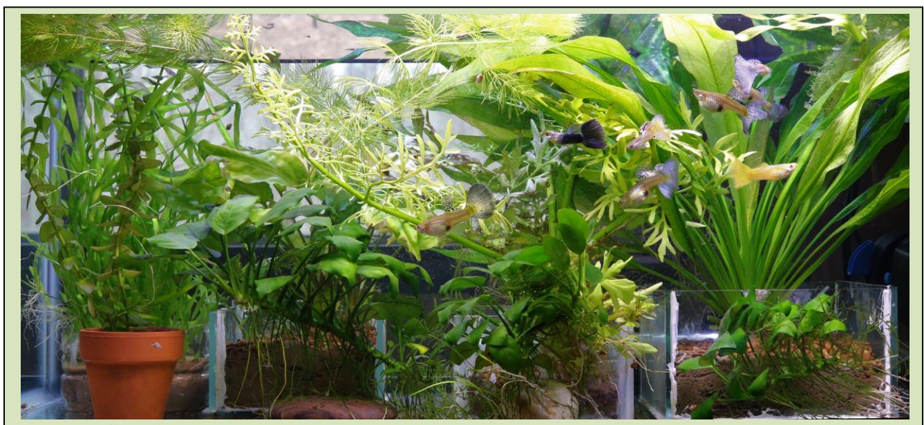
Rescued Guppies Seven days after treating 10 sick guppies with Levamisole HCl (10 mg/l for 24 hours), the 9 survivors made a complete recovery from a fluke infestation. These particular fish (both the fancy-bred HD Blue Grass and various pet shop fish) seem to have some innate resistance to the flukes.